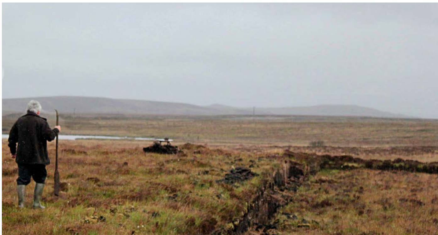
Cutting the peat