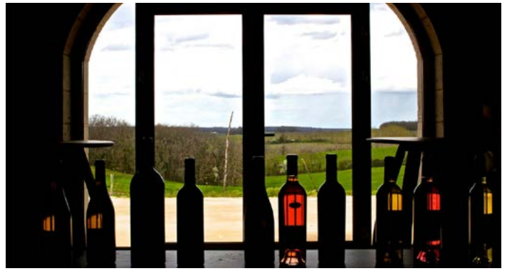
Right: View from Chateau Pellehaut, makers of rich, bourbon-like Armagnac