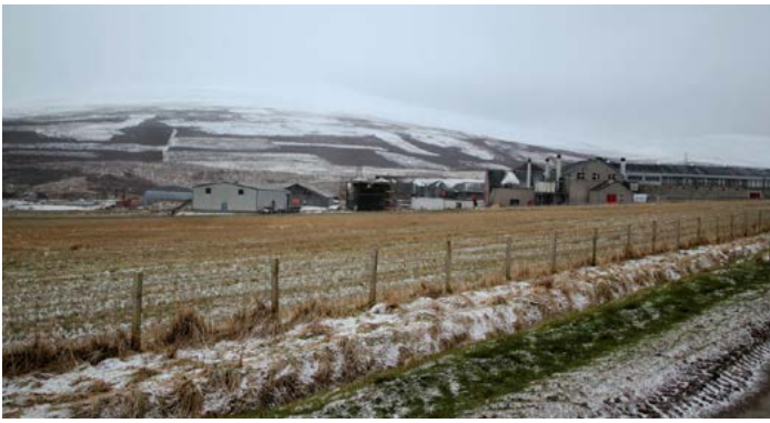
Left: The mighty mountain Benrinnes, covered with snow behind Glenfarclas