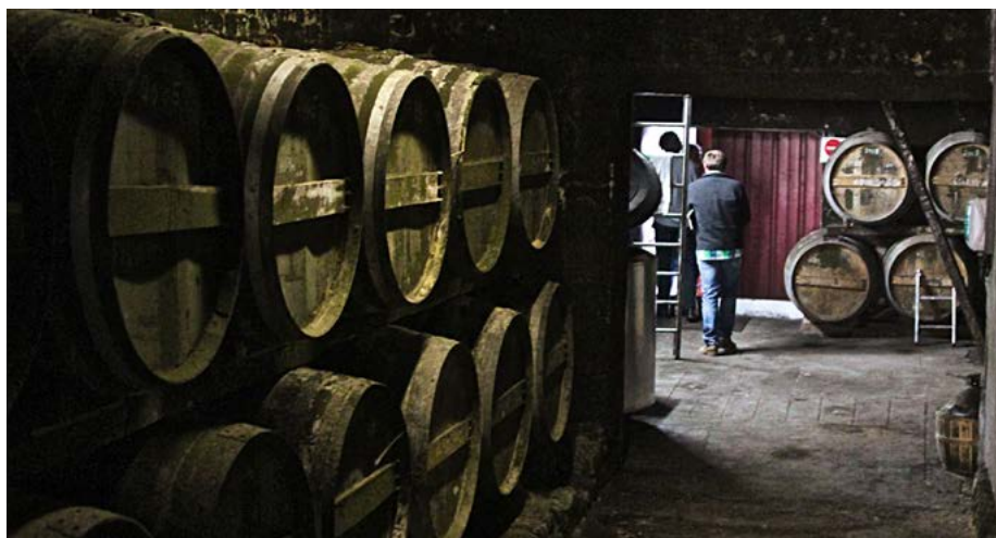
In the unassuming cellar of Ragnaud-Sabourin, the luxury is in the barrel